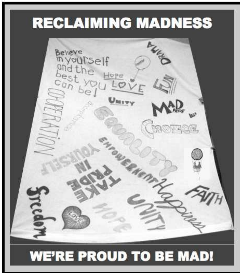
MAD PRIDE 2009

LOCATION: 1001 Queen St. West, Toronto, ON MAILING ADDRESS: c/o CAMH, 1001 Queen St. West, Toronto, ON M6J 1H4 DROP-IN HOURS: Monday to Friday, 1-4 pm PHONE HOURS: Monday to Friday, 9-5 pm TEL: 416-595-2882 FAX: 416-595-0291 E-MAIL: csinfo@camh.net WEBSITE: http://www.csinfo.ca/